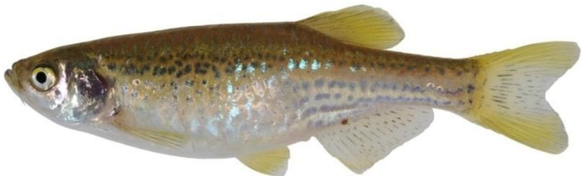
Fig. 3. Danio species from Bukit Brown: A, Danio albolineatus , 26.0 mm SL; B, possible hybrid of Danio albolineatus and Danio rerio , 27.2 mm SL; C, Danio rerio , 20.1 mm SL; D, Danio rerio ‘frankei’ variety, 39.1 mm SL.