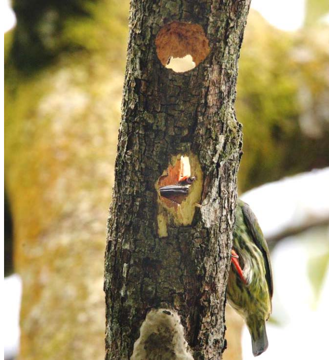
causing the chick to abandon the nest (Photograph by: Lee Tiah damaged (Photograph by: Lee Tiah Kee). Kee).