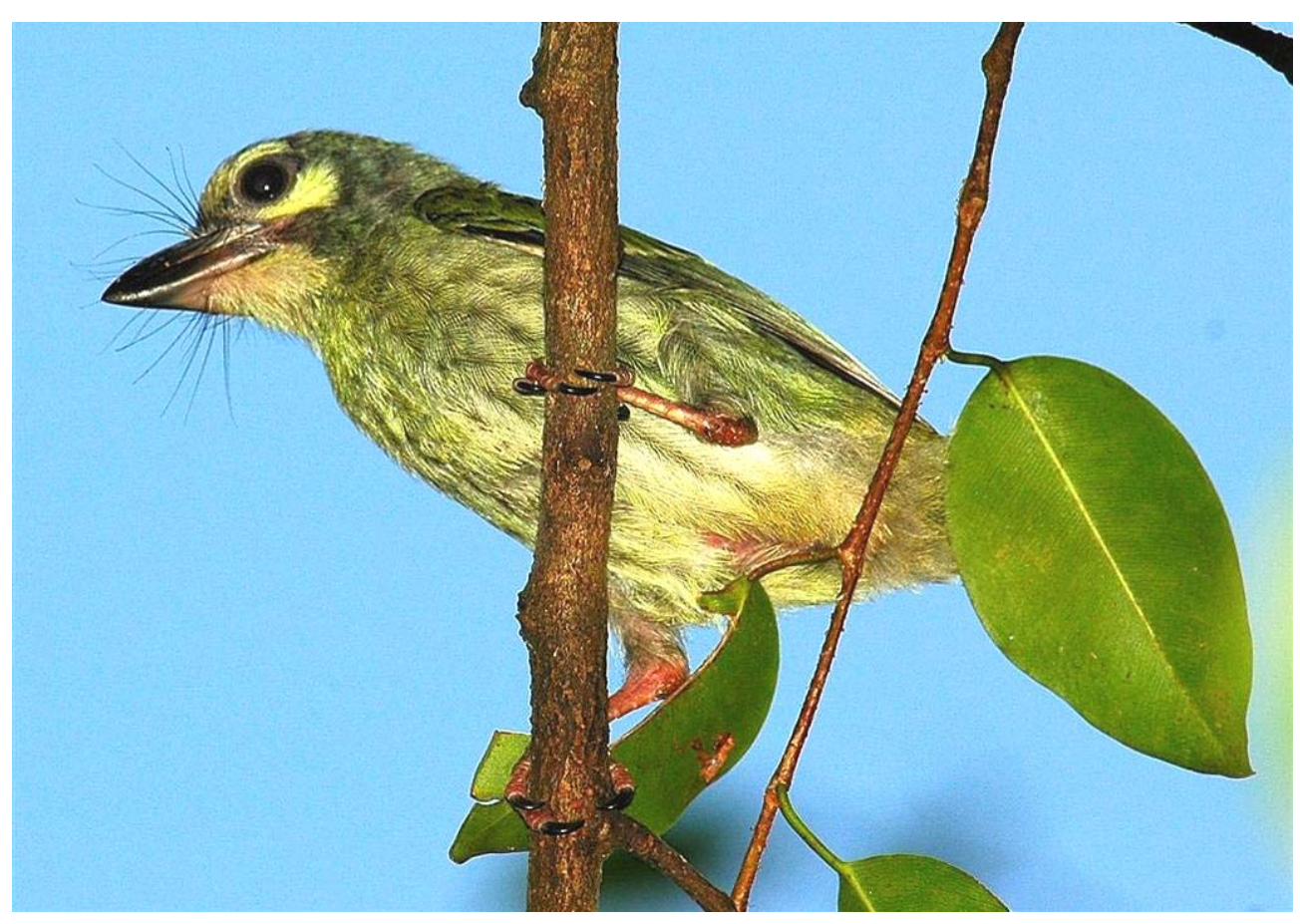
Fig. 4. A dull-coloured immature bird clearly lacking the red of the adult plumage.