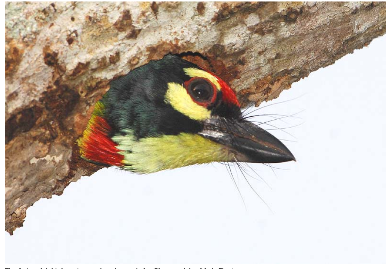
Fig.\ 5.\ An\ adult\ bird\ peering\ out\ from\ its\ nest\ hole.\ (Photograph\ by:\ Mark\ Chua).