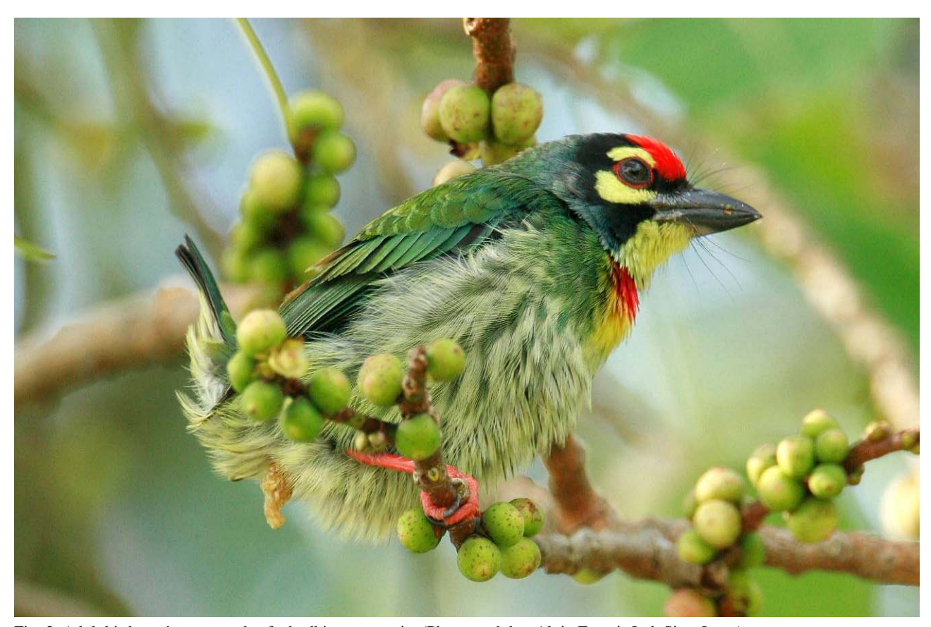
Fig. 3. Adult bird passing out seeds of a bodhi tree syconia.