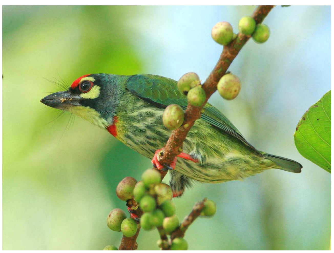
Fig. 1. Megalaima haemacephala indica adult photographed on a bodhi tree (Ficus religiosa) branch in Lake View Promenade just outside the Japanese Garden. (Photograph by: Alvin Francis Lok Siew Loon).

foods for feeding its young, immediately after the eggs hatch or when they require nutrients essential for growth and development (Shorts & Horne, 2002).