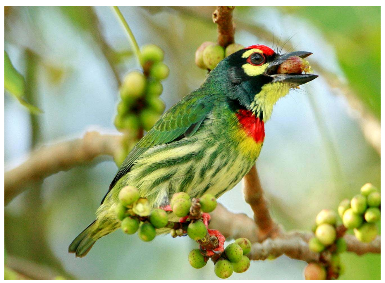
Fig. 2. Adult bird eating a bodhi tree syconium.