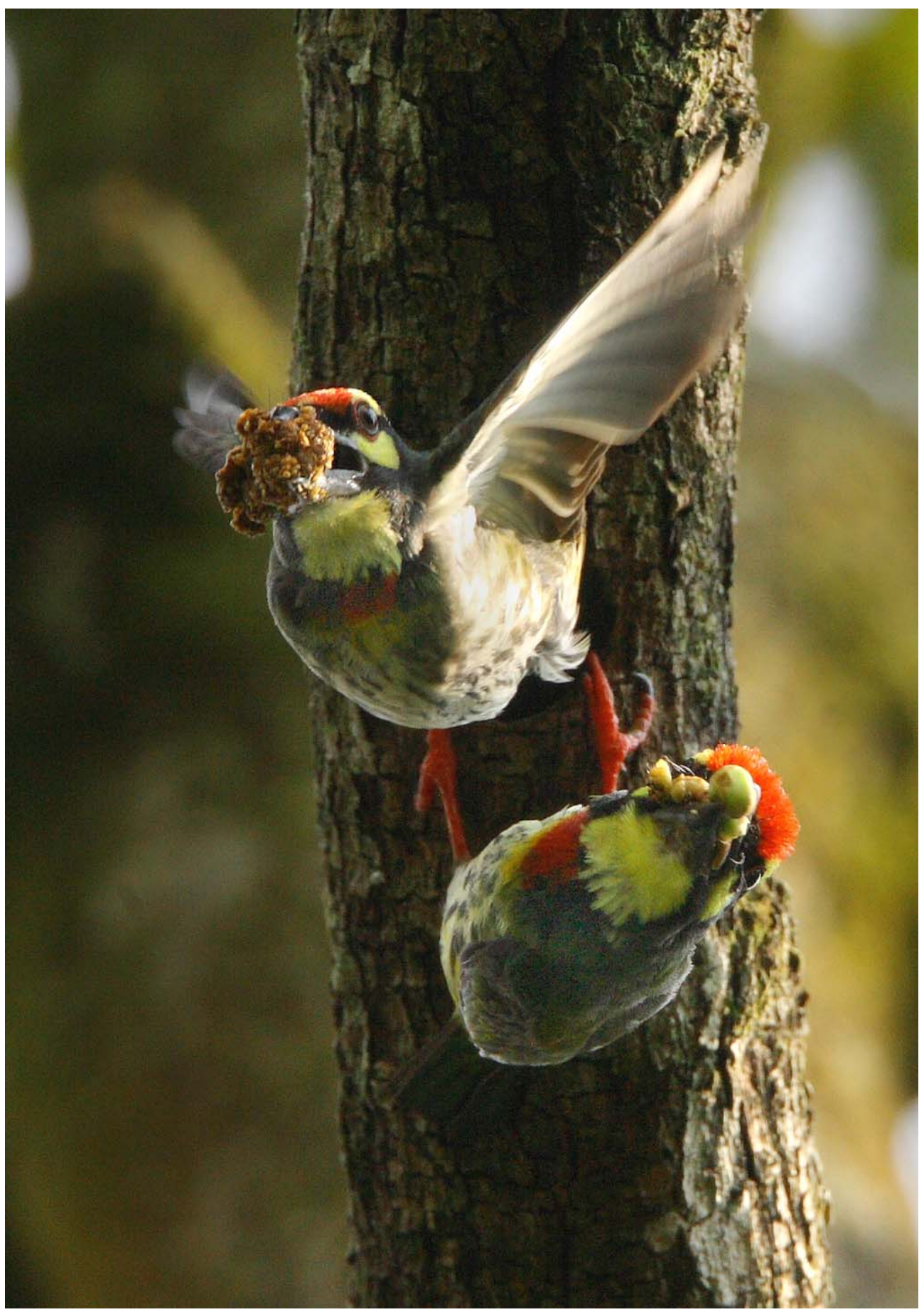
Fig. 7. A parent bird removing faecal material from the nest hole, while the other parent returns with food.