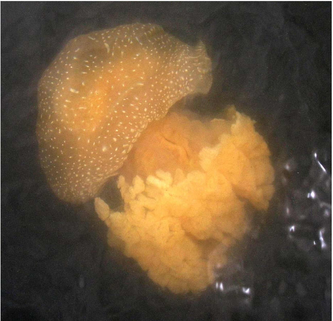
Fig. 3. Short-tentacled jellyfish ( Thyanostoma species) (in-situ), Johor Straits.

The juvenile fish (ZRC 51495: 24.9 mm SL) also has a laterally compressed body, but is pale orange and translucent. Its pectoral fins are deep orange, large and rounded, and reaching to the caudal peduncle. Its dorsal and anal fins are rounded, dark orange, and together with the body, form a triangle. The caudal fin is hyaline with an outer orange margin.