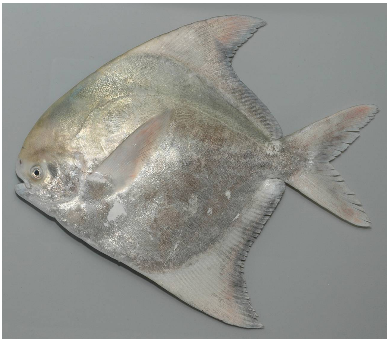
Fig. 1. Pampus chinensis , adult, ca. 300 mm SL, Johor Straits.

In Asia, pomfrets of the genus Pampus are economically important in fisheries (Tan et al., 1996; Carpenter & Niem, 2001). The Chinese pomfret, Pampus chinensis (Euphrasen) (Fig. 1), also known as dǒu chāng in Mandarin, is commonly sold in wet markets in Singapore, and commands moderate to high prices of S$15–35 per kg, depending on the size. All pomfrets in Singapore are caught in the surrounding sea, mainly with gill nets and drift nets. According to a local fisher (H. L. Oung, pers. comm.) and from personal observation, the Chinese pomfret, apparently a benthopelagic species, is usually caught at night. Juvenile pomfrets are rarely encountered. This article documents the observations of a live juvenile Pampus chinensis collected by the author.