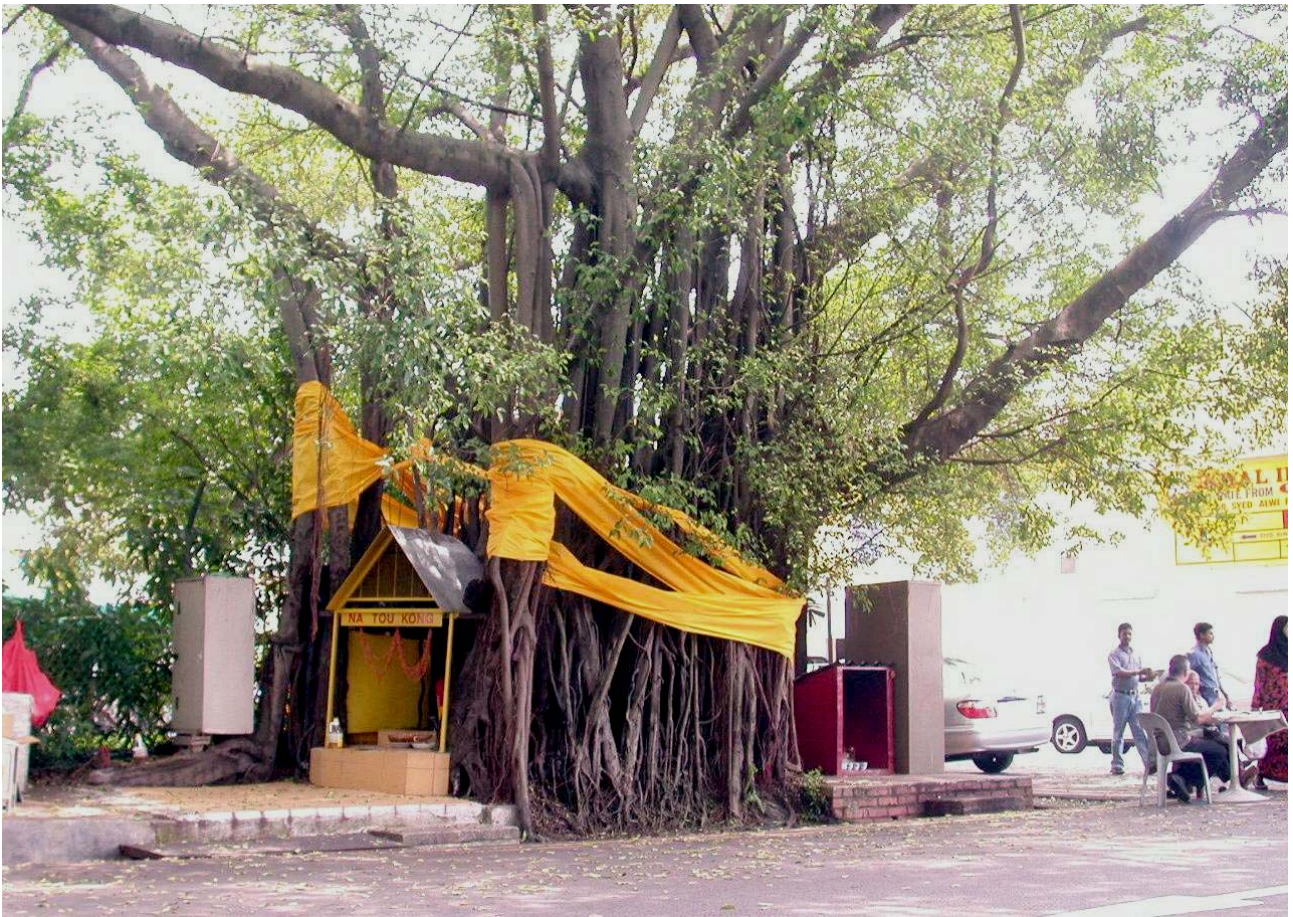
Fig. 29. A Malayan banyan tree at Dickson Road, off Serangoon Road that is considered sacred. Such trees are usually old and large, and designated with swaths of saffron-coloured cloth. Note the altar to the left of the trunk surrounded by aerial and pillar roots.