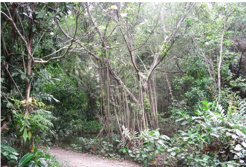
Fig. 14. A young Malayan banyan tree growing in a mangrove forest patch along the Sensory Trail, Pulau Ubin. (Photograph by: Angie B. C. Ng).