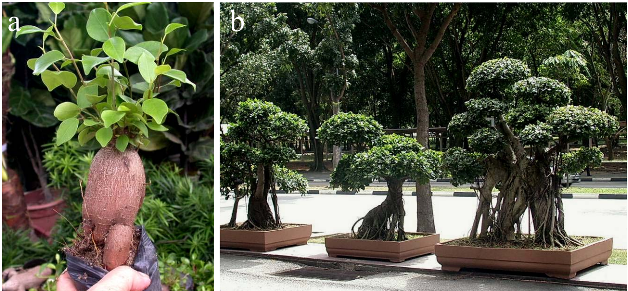
Fig. 25. Malayan banyan typical form grown as bonsai. (a) The swollen stem and roots signify abundance and prosperity. Unfortunately, the short stature of the bonsai plant signifies stunted growth and development, and is thus considered inauspicious! (b) Larger bonsai plants at an exhibition during the Lunar New Year. These are about half as tall as the roadside tree behind them.

The typical form of Malayan banyan, with green leaves, is often seen in nurseries as a bonsai plant (Figs. 25, 26), or topiary, but seldom sold as a sapling for planting. However, the ease with which stem cuttings will root, makes propagation from wild stock very easy.