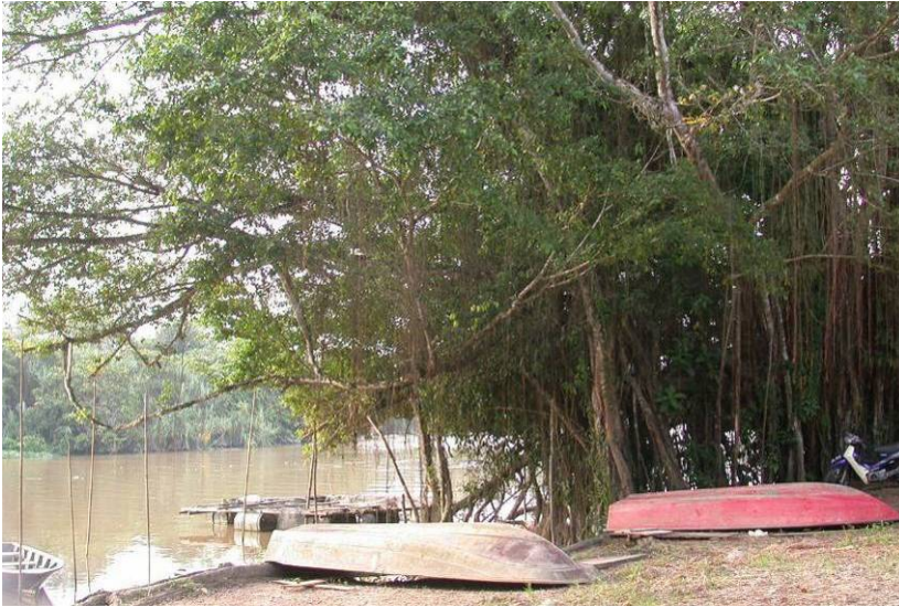
Fig. 12. A Malayan banyan tree growing near Mawai, along the Sungei Sedili Besar, a tidal river in Johore, Peninsular Malaysia.