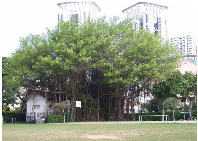
Fig. 1. Habit of Malayan banyan. (a) A young tree near the Raffles Building, off Evans Road, with a round crown. (Photograph by: Hugh T. W. Tan). (b) Mature tree at Upper East Coast Road with a wide, flattened crown. The basketball hoop height (3.05 m) provides a scale. (Photograph by: Angie B. C. Ng).