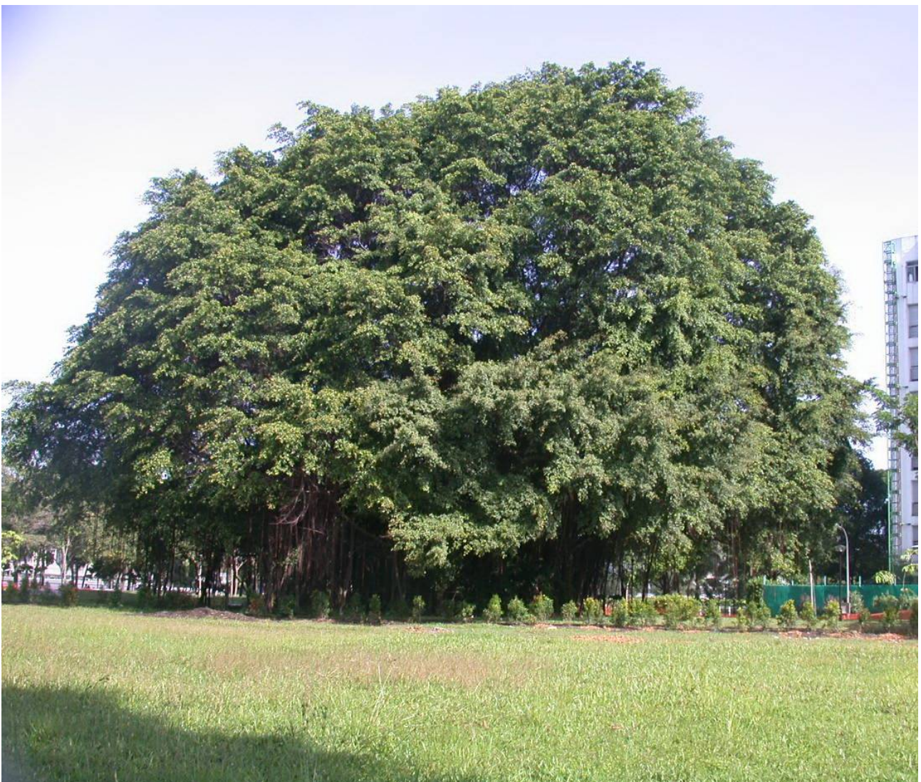
Fig. 2. Massive mature tree along Rochor River, between Kampong Bugis and Kallang Riverside Park. The eight-storey building at its right provides a scale for its large size.