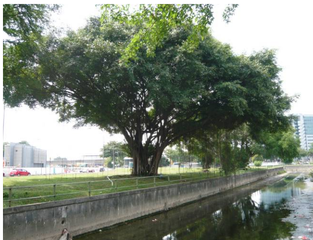
Fig. 26. Malayan banyan tree growing next to Geylang Canal (intersection of Guillemard and Paya Lebar Roads) demonstrating one way of how this species may be used for phytoremediation. Aerial roots grow from the long, horizontal branches, so they can uptake water and solutes in the canal water. The tree grows far enough away that its larger roots do not damage the concrete canal embankment by their growth and development. We have observed variation in the amount of aerial roots amongst different individuals, and because Malayan banyan can be grown by stem cuttings, individuals with desirable rooting characteristics may be conveniently cloned for planting for specific purposes.