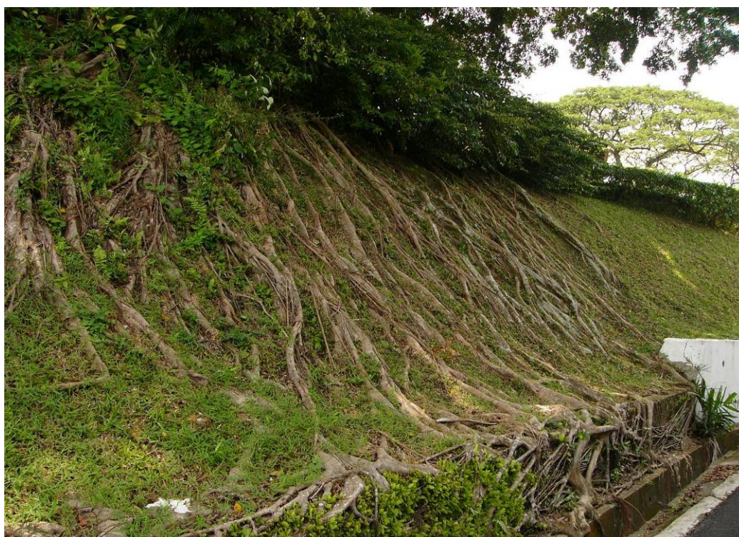
Fig. 28. Malayan banyan roots, seen here at Astrid Hill, can stabilise slopes because they grow vigorously over the soil surface and help to prevent soil erosion.