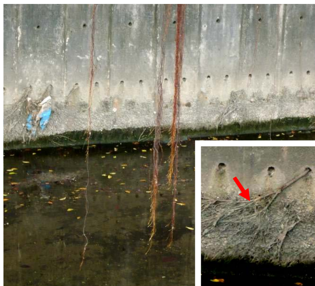
Fig. 27. Aerial roots from overhanging branches and that grow into the canal water to uptake water and solutes. In the rear, finely branched roots (arrowed) grow out of the weep holes of the canal embankment. Inset, the enlarged view. (Photograph by: Hugh T. W. Tan).