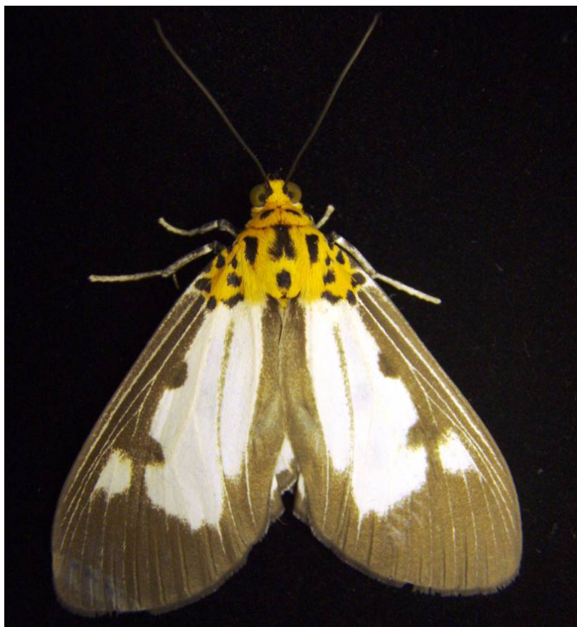
Fig. 20. Asota plana adult individual. (Photograph by: Ang Wee Foong).

Propagation. – It is easily propagated by stem cuttings or seed. To prepare stem cuttings, the short stem pieces should be left in a container under a running tap, to drain away the white latex for a few minutes, after which the cuttings may be left in a container of water to root (change on a weekly basis to avoid breeding mosquitoes!), or, planted into suitable rooting media such as washed sand or potting mix. Place the cuttings in a shaded area till they root. For cuttings in potting media, growth of roots is generally associated with development of shoots on the stem cutting. When suitably large, transplant to a larger pot. Plants about 1 m tall may be planted out in the field. With suitable training Malayan banyan can be grown as a bonsai, topiary, standard (single trunk with small crown) in a pot or ground, or as a hedge. Trees may be kept small by regular pruning.