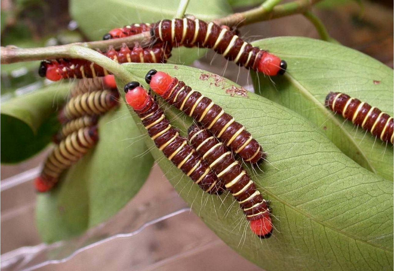
Fig. 19. Caterpillars of Asota plana feeding gregariously on the leaves of a Malayan banyan tree. (Photograph by: Angie B. C. Ng).

tree, can easily be trained to grow into a hedge or bush, to fit a smaller garden. Generally Malayan banyan is free from pests and diseases. Known pests of the plant include Gynaikothrips ficorum (Cuban laurel thrip; Fig. 18) and Josephiella microcarpae (Ficus gall wasp) have been reported to cause leaf deformation (Dreistadt et al., 2004). The caterpillar of the moth, Asota plana , eats the leaves of this and other fig species (W. F. Ang, pers. comm.; Figs. 19, 20). Although trees may lose most of their foliage from one such attack, they usually recover once the caterpillars pupate and emerge as adults to attack other trees.