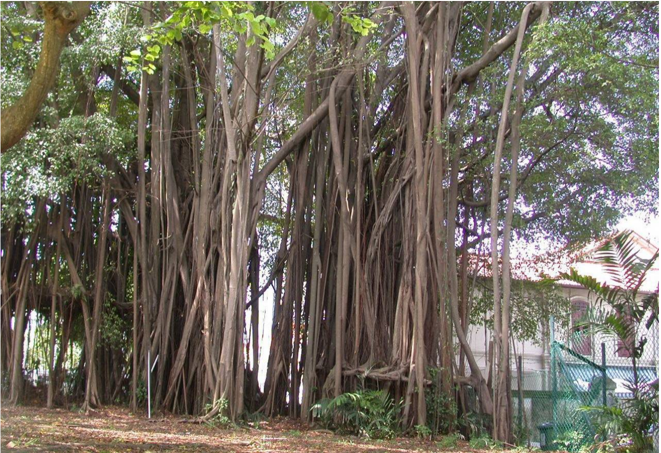
Fig. 5. Pillar-like roots can form impenetrable thickets like these of a tree at Sultan Gate, Kampong Glam.