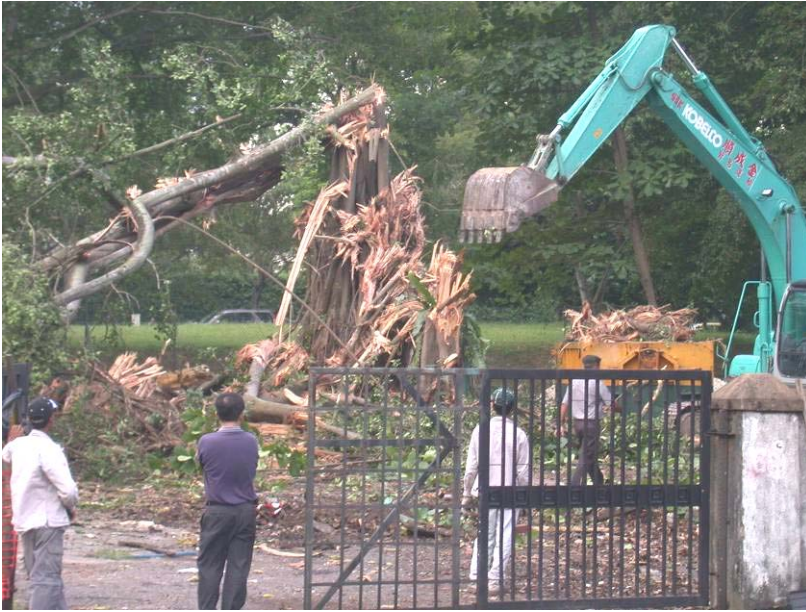
Fig. 21. Malayan banyan tree being felled with an excavator—possibly the most efficient way to deal with such massive pillar roots and trunk. (Photograph by: Angie B. C. Ng).