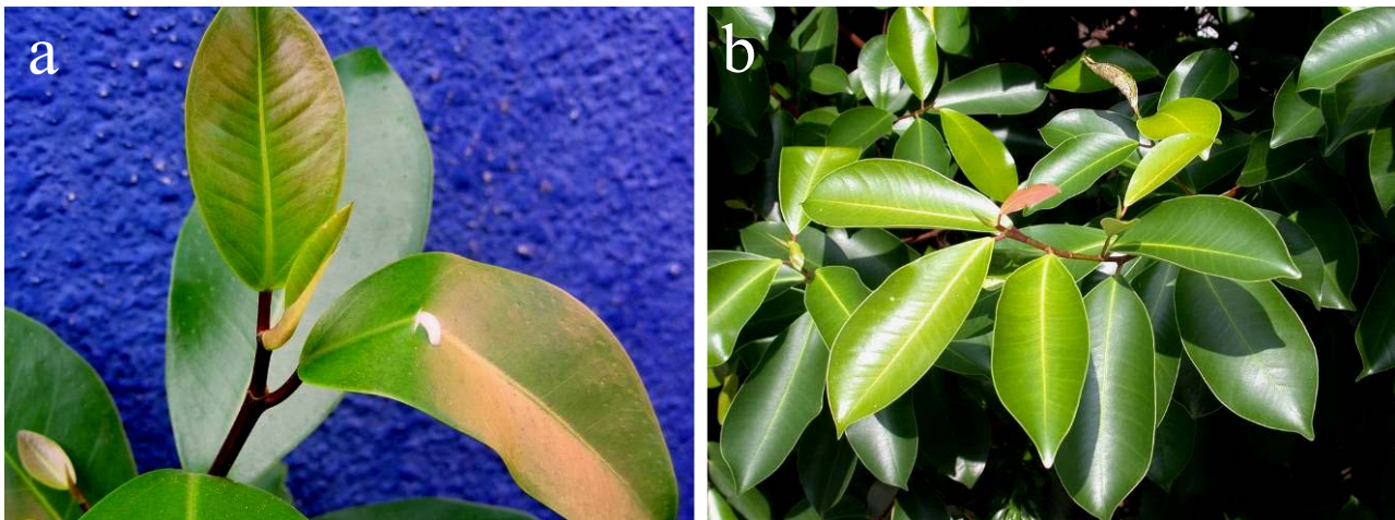
Fig. 8. Leafy twigs. (a) Twig tip showing from apex down a young leaf unfurling, with a stipule to its bottom and right, a new leaf, a mature leaf with its leaf blade broken to show the white latex oozing from the break. A stipular scar is seen at where the leaf stalk is inserted into the leaf. The scar is the point of attachment of the stipule before it was shed. (b) A leafy twig showing the shoot tip which is enclosed by the hood-like stipule, a young leaf with a pink leaf blade, and older leaves with leaf blades that have a slightly shiny, smooth surface. The shine will be lost as the leaf ages.

Flowers. – The tiny flowers grow inside, a round, 5–10 mm wide structure called a syconium or fig (Figs. 9–11). [That the flowers occur inside the syconium is why the Chinese call the figs, wú huā guǒ (无花果/無花果).] The syconia are stalkless (or stalked to 5 mm long,) and grow singly or in pairs at the leaf axils. The pollinator is a fig wasp ( Eupristina verticillata ; Hymenoptera, Agaonidae, Agaoninae) which has a complicated life cycle intertwined with that of this plant (Wiebes, 1994). Most fig species have one major pollinator fig wasp species with which each species co-evolves. This relationship in figs is described very well by Corner (1988).