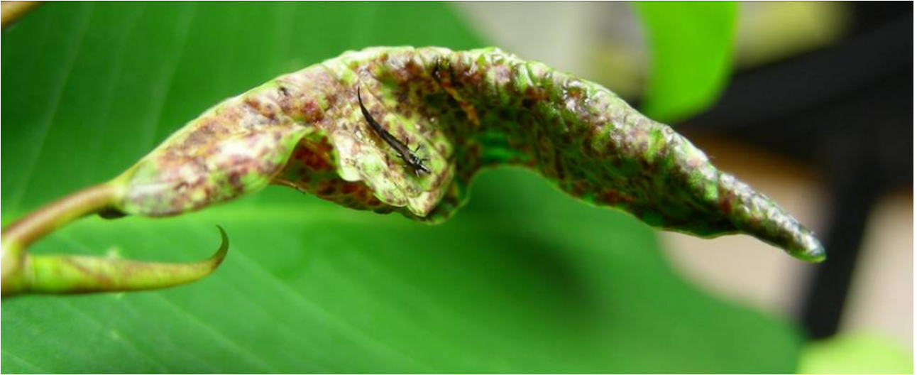
Fig. 18. Unidentified thrip (Thysanoptera) on a damaged leaf.

tree, can easily be trained to grow into a hedge or bush, to fit a smaller garden. Generally Malayan banyan is free from pests and diseases. Known pests of the plant include Gynaikothrips ficorum (Cuban laurel thrip; Fig. 18) and Josephiella microcarpae (Ficus gall wasp) have been reported to cause leaf deformation (Dreistadt et al., 2004). The caterpillar of the moth, Asota plana , eats the leaves of this and other fig species (W. F. Ang, pers. comm.; Figs. 19, 20). Although trees may lose most of their foliage from one such attack, they usually recover once the caterpillars pupate and emerge as adults to attack other trees.