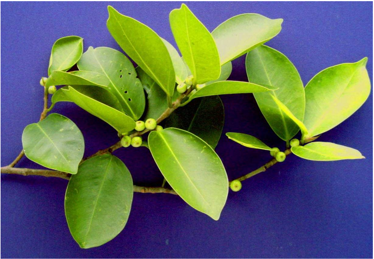
Fig. 9. Unripe, green syconia on leafy twigs.