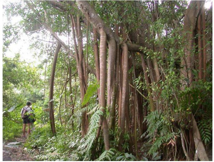
Fig. 4. The horizontal branches develop aerial roots which grow into the ground, ultimately to become pillar-like with growth, to support the widespread branches. These can form impenetrable thickets because they are so strong and rigid.