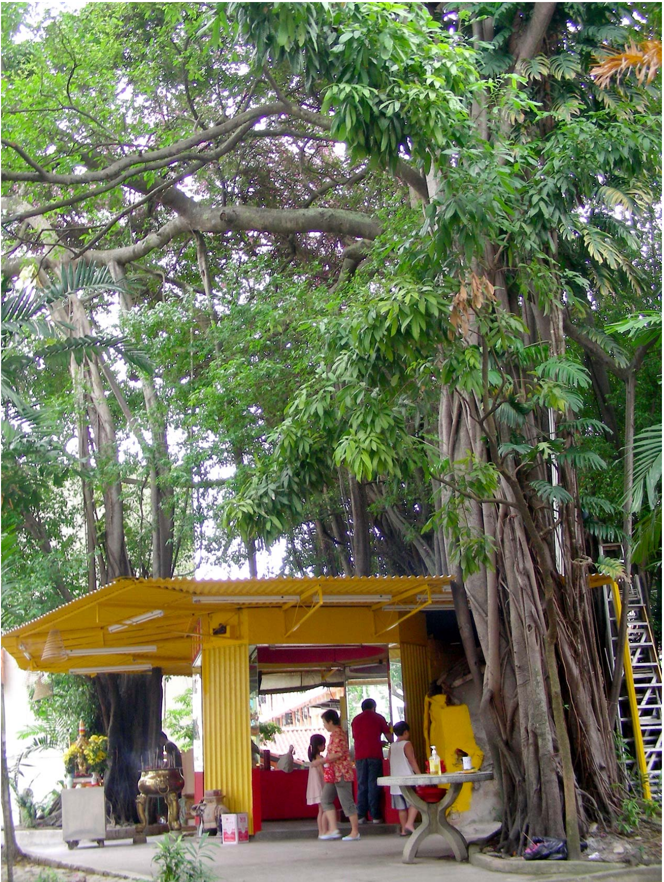
Fig. 30. A large specimen of the Malayan banyan growing in the Buddhist shrine at Toa Payoh Central. The yellow and red altar is situated at the foot of the tree. A small tree with pinnate leaves grows in front of it. The trunk of this tree consists of numerous pillar roots. Its horizontal branches are thick and produce pillar roots that grow into the ground at the left of the altar. The aroid climber, dragon-tail plant ( Epipremnum pinnatum ), with dark green, pinnate leaves grows up the side of the tree. This species was once believed by locals to be a cure for cancer, but has since lost this reputation.