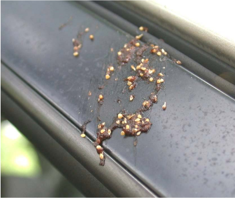
Fig. 15. Malayan banyan seeds in the faeces of a bird on the seal of a car window. (Photograph by: Angie B. C. Ng).