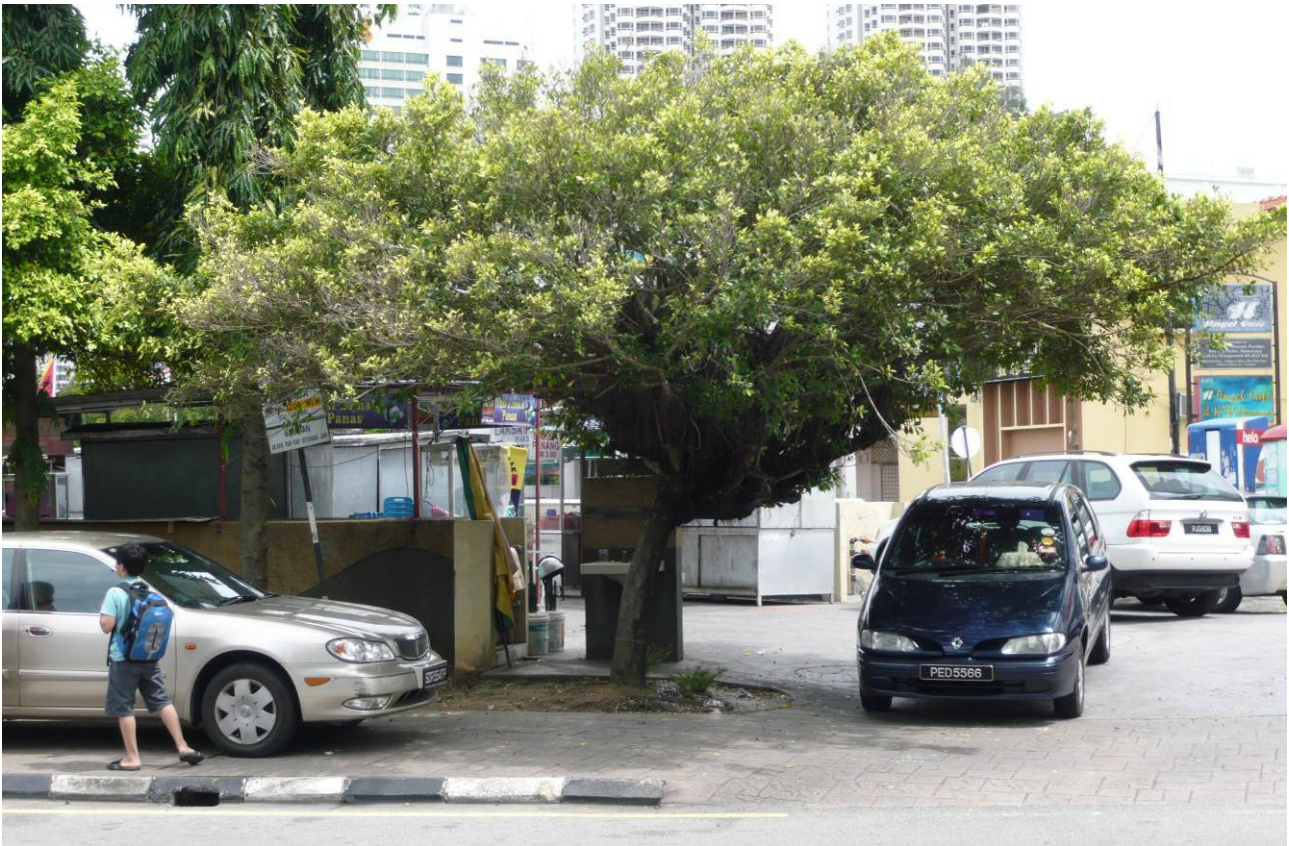
Fig. 23. Ficus microcarpa 'Golden', a popular cultivated variety of Malayan banyan, grown as a standard (single-trunked tree, with aerial roots trimmed off) in George Town, Penang, Peninsular Malaysia as a roadside tree. This species is tolerant of roadside pollution.