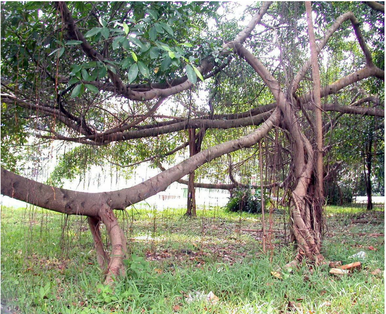
Fig. 6. Pillar roots may also be widely separated, allowing long, horizontal branches that may span several metres across.