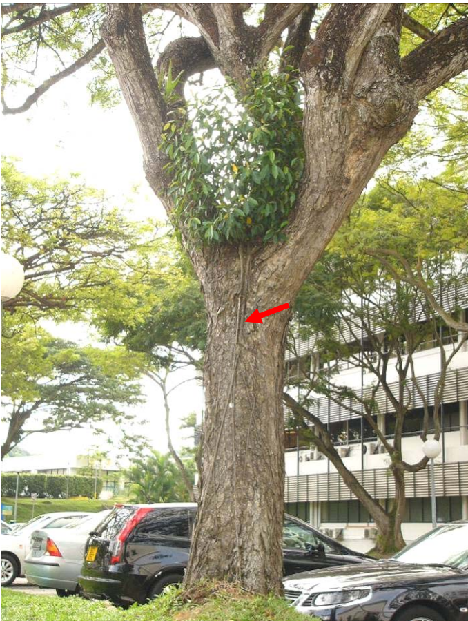
Fig. 16. Malayan banyan sapling growing from the crotch of a rain tree ( Albizia saman , formerly called Samanea saman ) host plant. In the early stages, most of the growth of the young plant is to develop roots that grow into the ground for a more steady supply of water and mineral nutrients (straight, cable-like roots seen here; arrowed). Subsequent growth would be to increase the stems and foliage of the plant as well as to develop more roots that will wrap themselves around the host tree to ultimately kill it.

The ripe syconia or figs are eaten and the seeds dispersed by birds (Fig. 15), the seeds often germinating in branch forks of trees or cracks in built structures to grow as epiphytes which send their aerial roots to the ground (Weber, 2003; Fig. 16; see also Horticulture:Utilisation ). The host trees may be killed by the contractile aerial roots which crush the tree or wrap themselves round the trunk (Weber, 2003). These aerial roots are so tightly contracted that they can be strummed like the strings of a guitar (Fig. 16)!