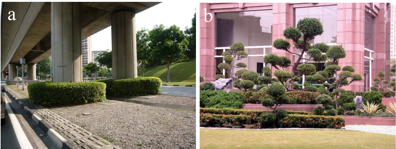
Fig. 24. Ficus microcarpa 'Golden'. (a) Plants grown as a hedge to surround the pillars of the MRT rail line along Commonwealth Avenue West. (b) Grown as a topiary at Great World City, Kim Seng Road.

Commercial Availability. – In Singapore, this species is available in commercial nurseries, often as a yellow-leafed cultivated variety (cultivar)— Ficus microcarpa 'Golden' (Boo et al., 2006). This is often grown along roads as a short or tall hedge (Fig. 24a), standard (Fig. 23), or topiary (Fig. 24b). The degree of yellowness in its leaf blade is correlated with the degree of exposure (Yamasaki et al., 1995).