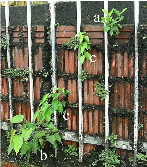
Fig. 13. Three of Singapore's most common urban fig ( Ficus ) species (with the larger leaves) growing as saplings from cracks in a wall, together with some weed species (with smaller leaves). Malayan banyan is the top right plant (a), the bodhi tree ( Ficus religiosa ) is at the bottom left (b), and the Benjamin fig ( Ficus benjamina ), the two saplings in between (c).