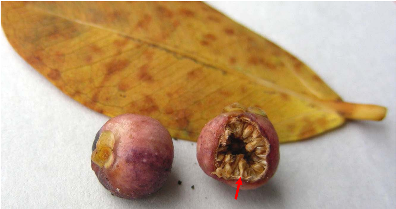
Fig. 11. Ripe syconia and a dead leaf.. The left syconium shows the basal bracts. The right syconium is sectioned to show the developing fruits. A good example of a developed fruit (arrowed) with an obovate, stalked structure, containing one seed. The leaf is shortly stalked. Syconium width = 10 mm.