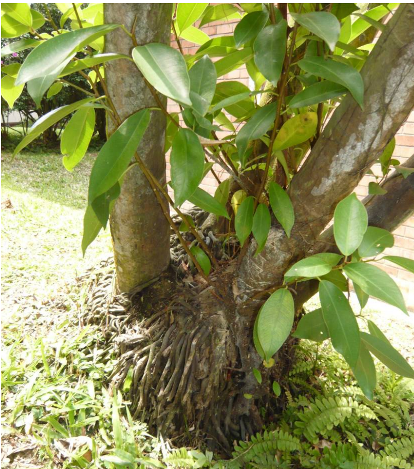
Fig. 22. Malayan banyan growing from the base of a clump of MacArthur palm ( Ptychosperma macarthurii ). This sapling has been cut down to a stump but has coppiced, by sprouting several new leafy branches. This species is difficult to eradicate because the whole plant, including roots, must be removed to ensure that it does not grow back. While this plant's ability to coppice presents problems for maintenance of streetscapes, as well as landscaped gardens and parks, the ability to vigorously regrow can be exploited for phytoremediation of pollutants in water, or as a fuel crop for power generation.

ensure that the host tree is not also poisoned by the herbicide when eradicating hemiepiphytic Malayan banyan plants. Unwanted trees, if allowed to grow, are costly to remove because of their size (Fig. 21).