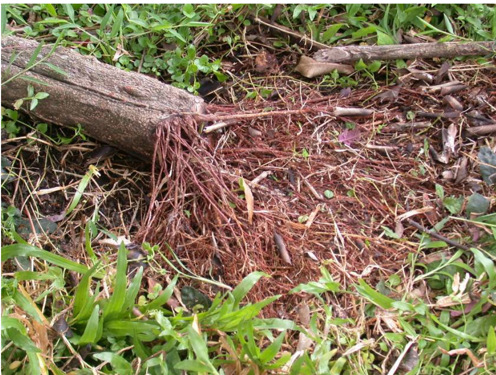
Fig. 7. Numerous branch roots grow from the cut end of a mature aerial root.